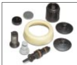
SP300 Standard Field Repair Kit (055673)

Shindaiwa has a full line of accessories. Here are a few.