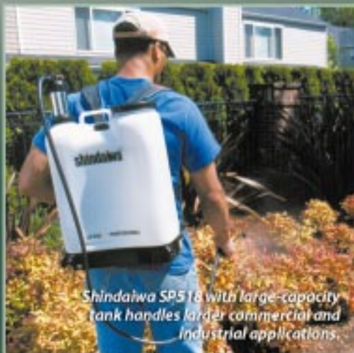
Shindaiwa SP518 with large-capacity tank handles larger commercial and industrial applications.