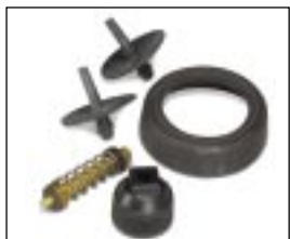
SP415 Viton® Field Repair Kit (568931)