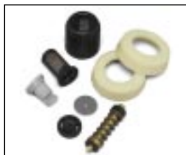
SP518 Field Repair Kit (285221)

These are only a few examples of the available sprayer accessories. Refer to the Shindaiwa Product Catalog for a complete list.